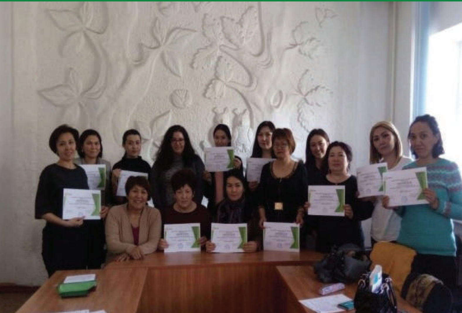
Certified courses on teaching technologies are often practiced