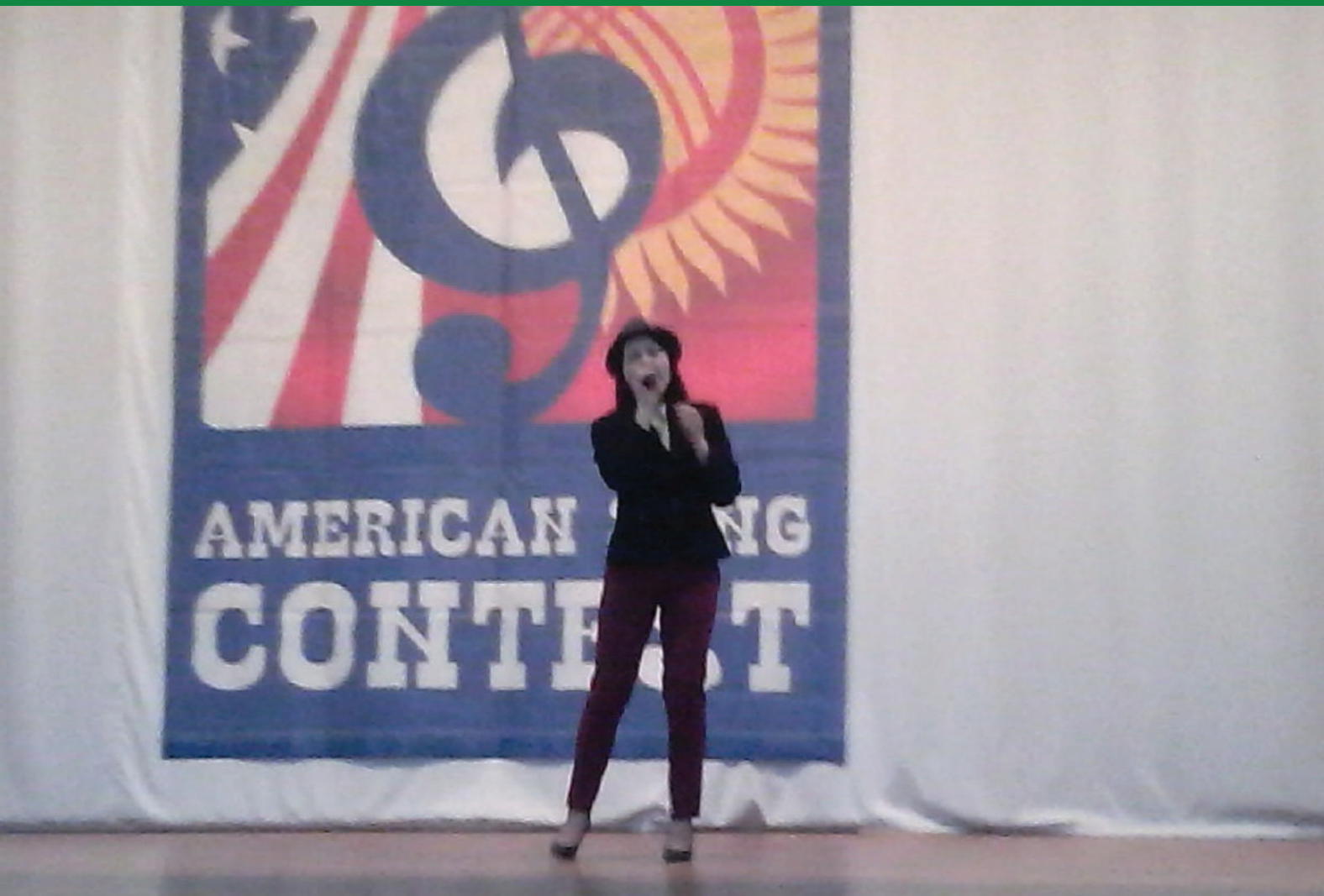
American song contest at KNU