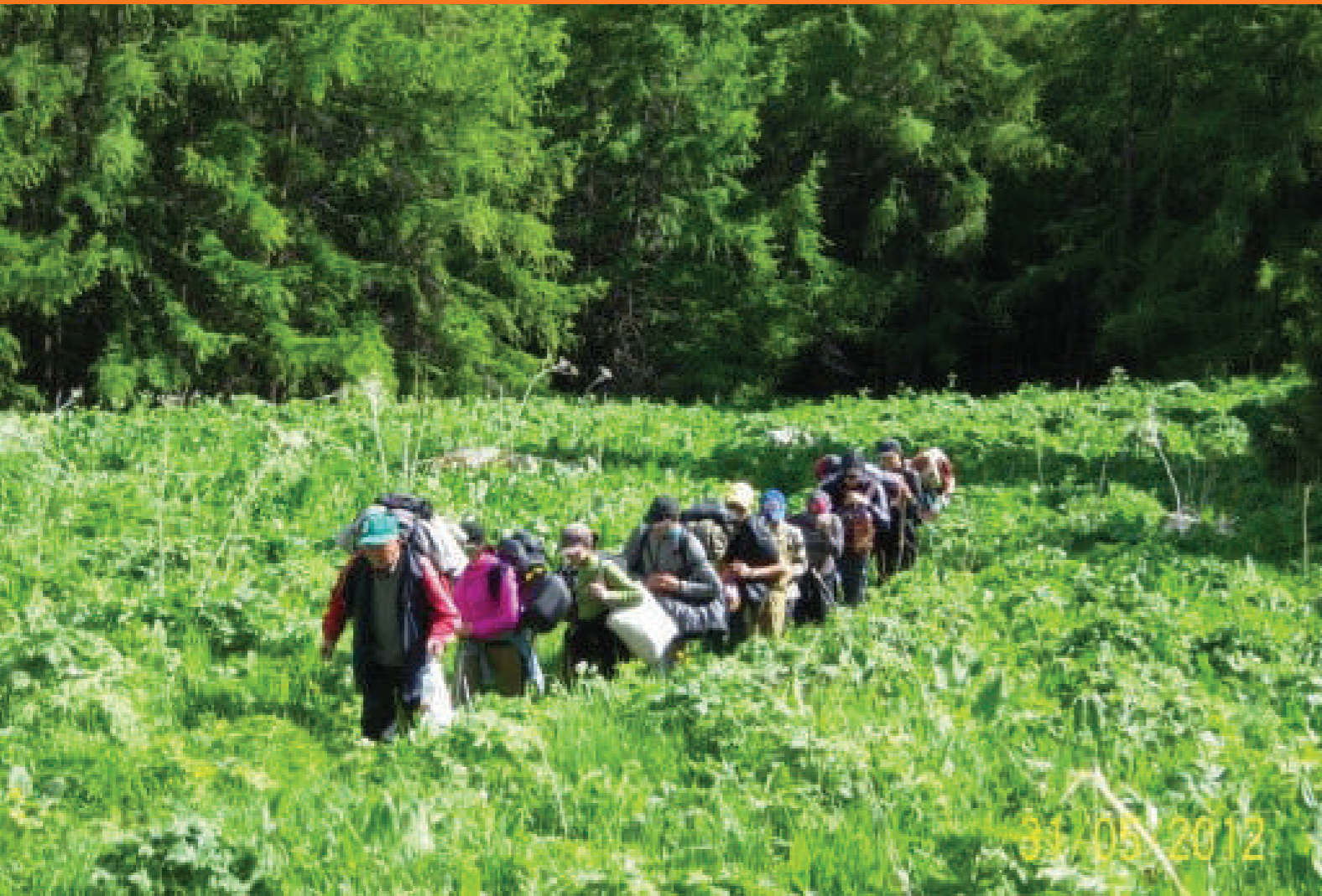
Field work of students