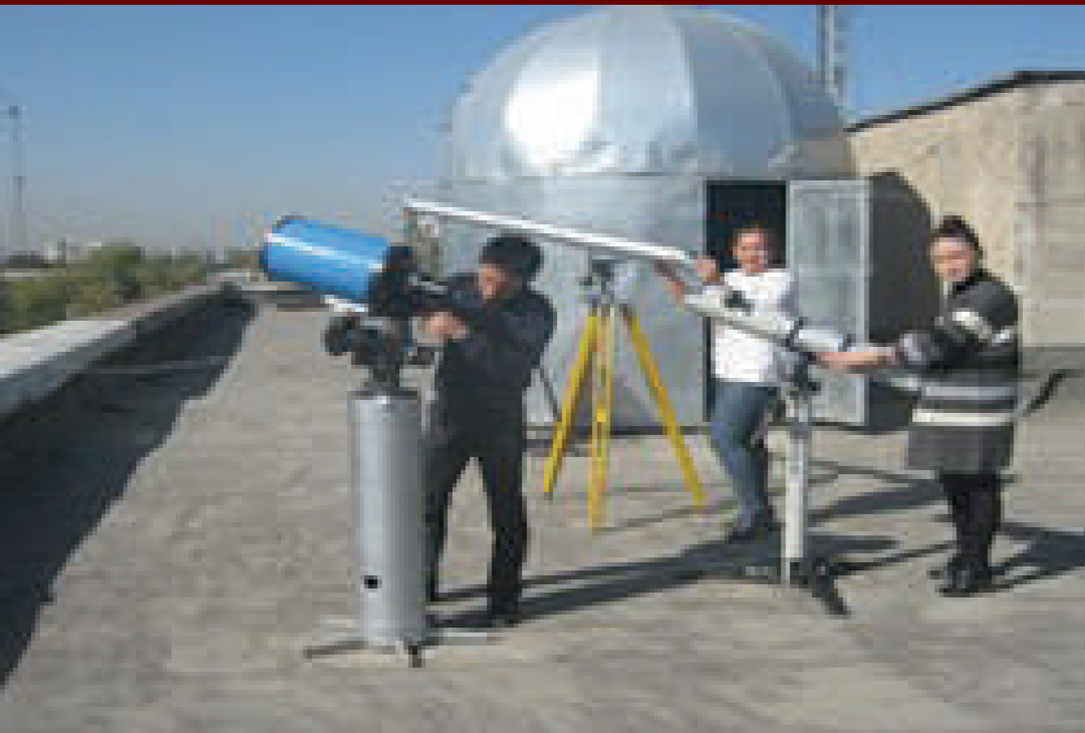
The lesson is conducted in the observatory