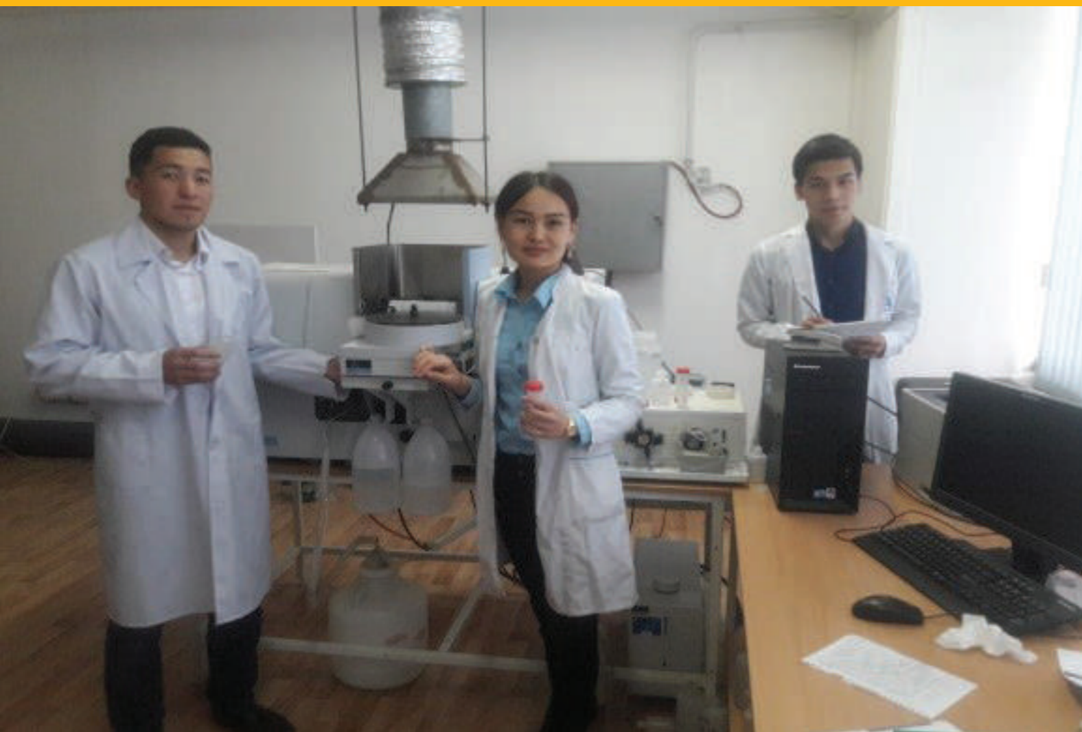
Laboratory analysis of drinking water

Faculty of chemistry and chemical technology is one of the youngest faculties of Kyrgyz National University named after Jusup Balasagyn. The faculty is the only educational department which prepares highly qualified specialists – wide range chemical specialists.