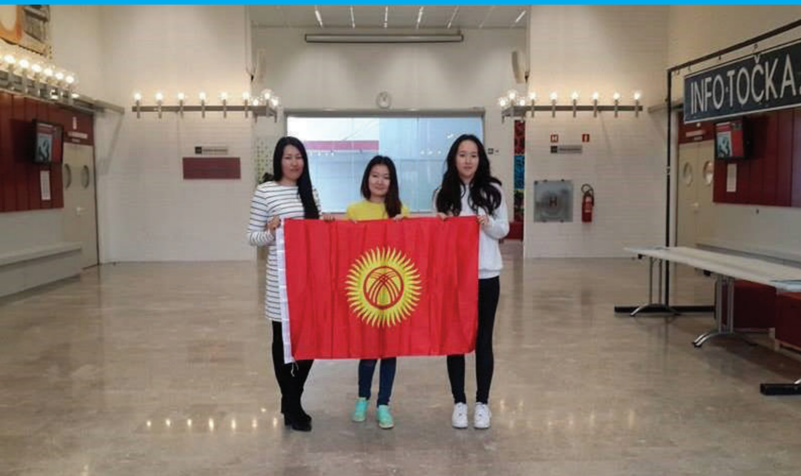
Students after presentation on Kyrgyzstan in France