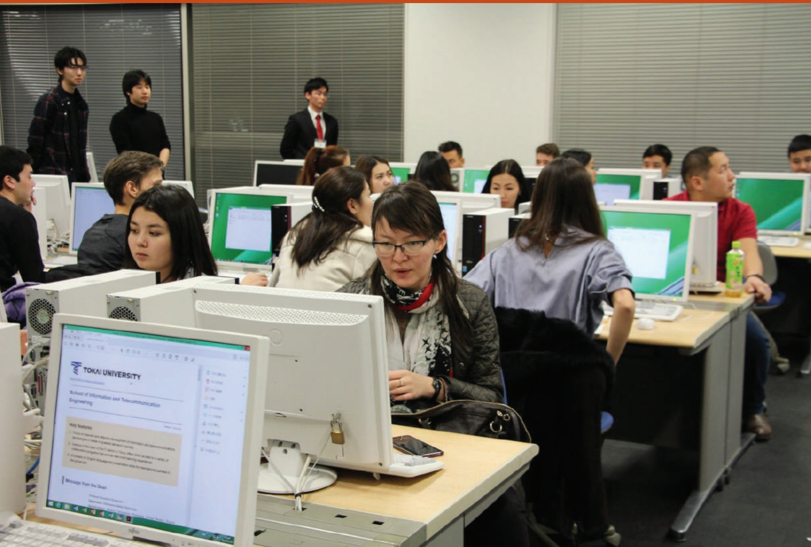
Kyrgyz interns at Kokushikan University in Japan

The Faculty of Information and Innovation Technology (FIIT) was founded in September 2015. There are 4 chairs within the faculty: