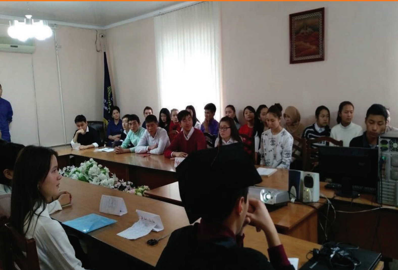
Students discussing “The Day against corruption”, December 2017

History of Faculty. Center for Master’s degree and PhD programs was set up in 1996 at KNU for realization of multilevel preparation of specialists with higher professional education. During these years more than 2000 highly skilled graduates holding Master’s degrees and PhD in 20 fields were prepared. Out of all of them 500 Masters graduated from the University with distinction, 900 obtained PhD degrees and 238 got the second higher education diplomas. By the order of KNU № 162 as of June 27, 2007 this Centre was reorganized into the Center of human resources development comprising lyceums of secondary education with additional departments of advanced retraining courses. In 2009 the Centre of human resources development was renamed into the Center of continuous education and retraining. Later in 2017 it was renamed as Faculty of retraining and staff development . Thus, the Faculty of retraining and staff development offers the following fields of study: