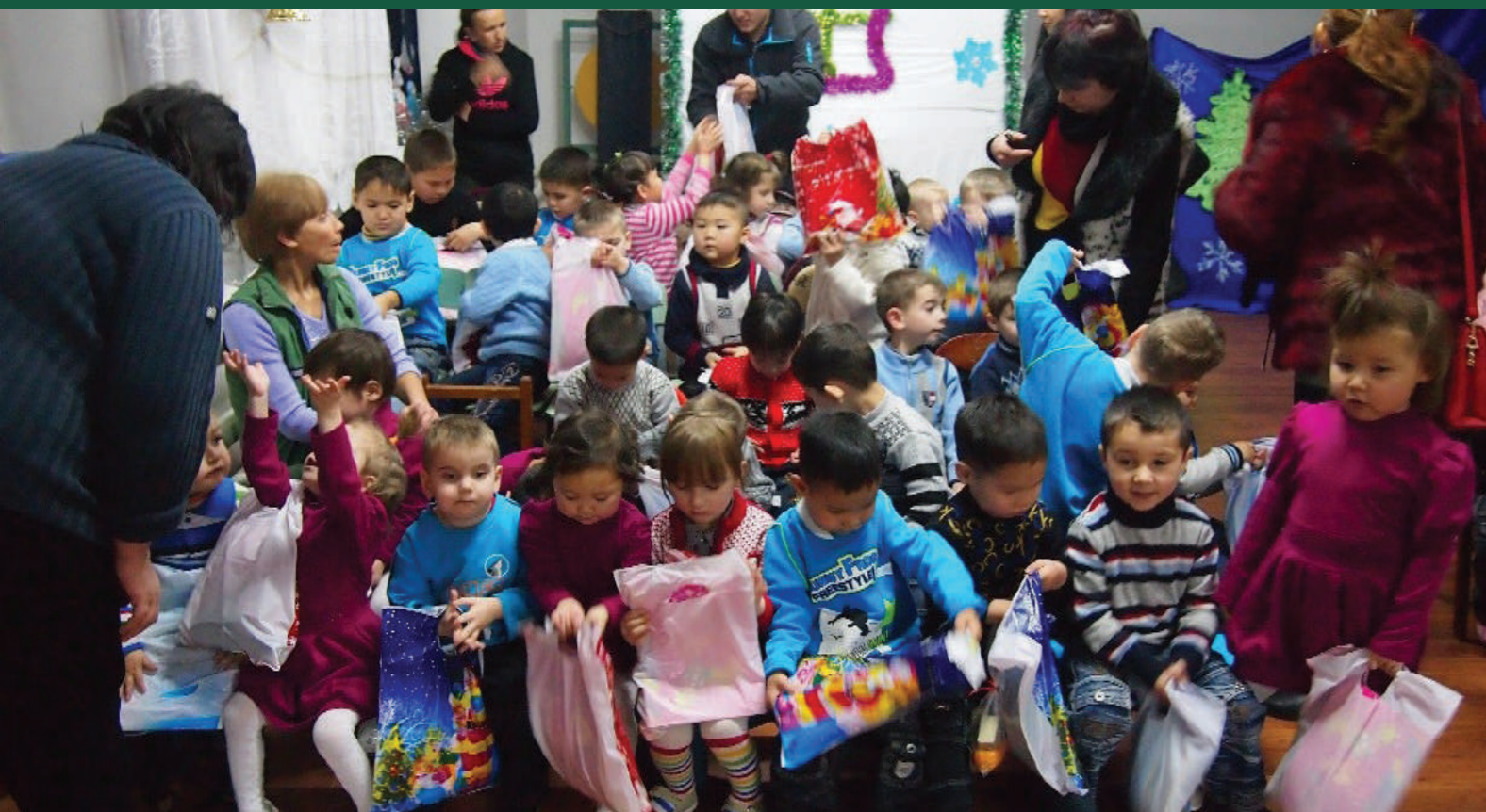
Students of International Relations often visit with gifts the Orphan House in Belovodsk