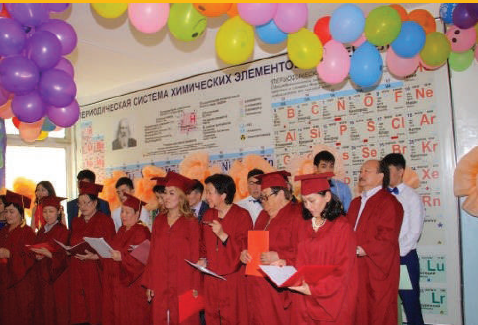
Celebration of “Chemist Day”

For the period from 2012 to 2017 a number of scientific researches were carried out at the faculty within projects financed by KNU named after J. Balasagyn, Ministry of Education of KR, and also in the framework of international projects. For the expired academic year: