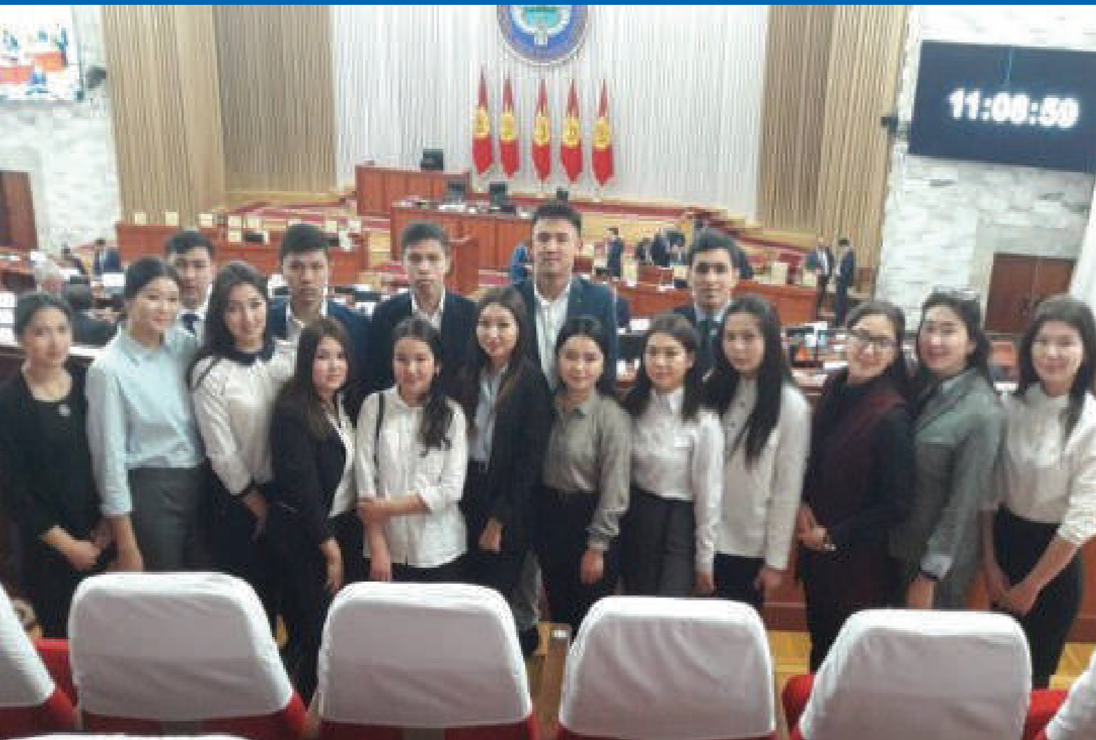
Excursion of students to Parliament of the Kyrgyz Republic