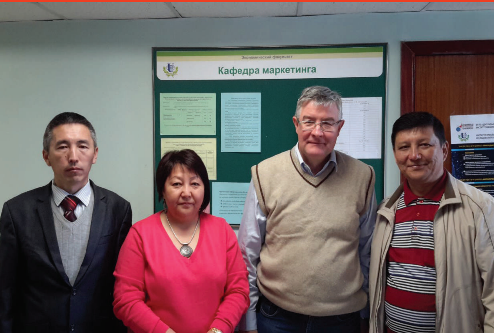
Developing Partnership project with Russian University of People's Friendship

The faculty of management and business is a structural subdivision of KNU, which has been transformed several times, taking different organizational forms as the Center, the Institute and the Faculty. Since 2015 – Faculty of Management and Business promoting the idea of implementing a new model of business education with a unified approach to teaching business and management disciplines and solving the following issues: filling theoretical courses with examples from practice of enterprises, business organizations and private firms; realization of new programs such as: marketing, commerce, logistics, quality management, personnel management; using interactive workshops to solve specific manufacturing situations on the domestic enterprises, learning through case -studies, etc.; using most advanced models of distant learning technologies. And we archived good results in implementing this idea.