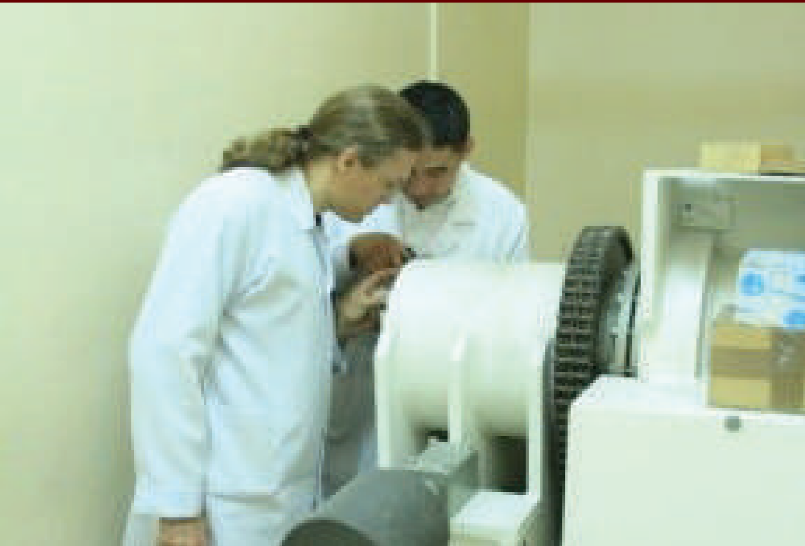
Place of work of medical physicist

Faculty of Physics and Electronics has more than half a century of tradition and experience in training highly qualified specialists, physics teachers, and more than a twenty-year experience in training electronic engineers. Physical and technical science in Kyrgyzstan is closely connected with Faculty of Physics and Electronics. Among its graduates there are academicians and members of Parliament, ministers and rectors as well as school teachers and engineers, that work for the benefit of our country.