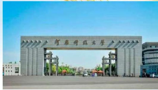
Henan University of Science and Technology