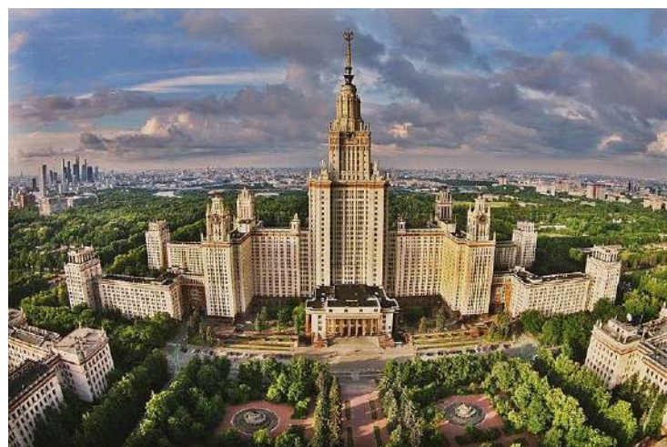
Moscow State University named after M.V. Lomonosov