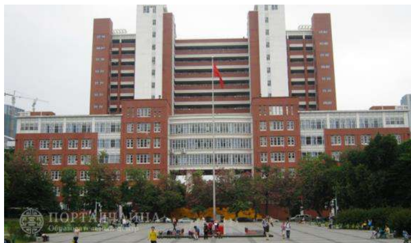
Henan University of Science and Technology