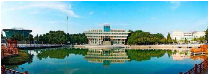
Xinjiang Normal University