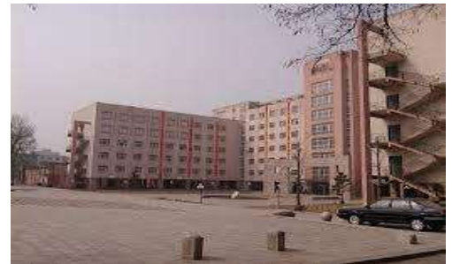
Anshan Normal University