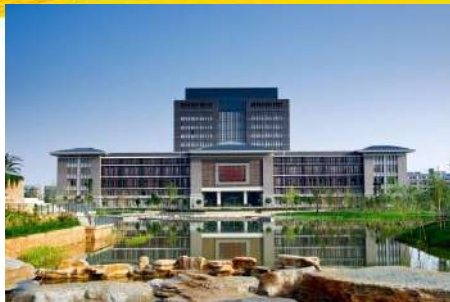
Yunnan Normal University