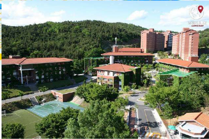
Keimyung University - Higher Education in South Korea