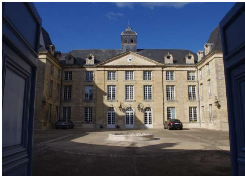
Université de Poitiers